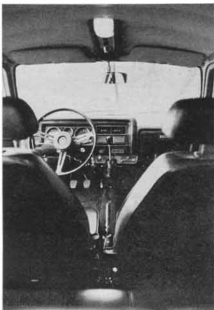
Above: The Honda car's air-cooled, two-cylinder engine has 36 hp. Left: Interior is spacious enough to easily carry two consenting adults. Below: Coupe's rear seat folds forward for extra luggage or area can become a small greenhouse.