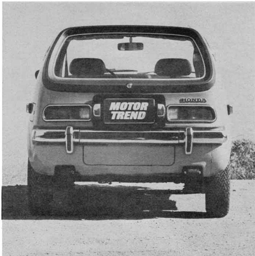
Above: Rear view of Honda makes it easy to visualize interior space-to-exterior size ratio achieved. Locking rear flip-up window simplifies loading of coupe. Below: Honda's all-steel unitized body is surprisingly tight and rattle-free.

If we could establish our Honda commuter system for a large city, it would be, with an automatic-type transmission of some sort and a bit of noise insulation, an ideal car. The present engine isn't the answer to smog, but it's small enough to cut the volume of pollutants measurably. Drop in a small, desmogged Wankel and you should be able to further reduce air pollution. We're not saying a fleet of Hondas would be the American cities final salvation, but it offers an immediate salve for strangling urban centers. /MT