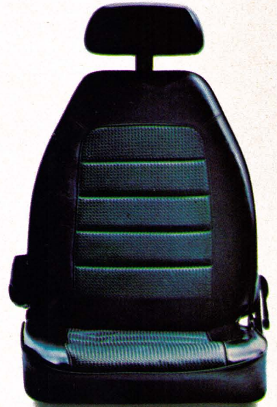
front bucket seats, standard