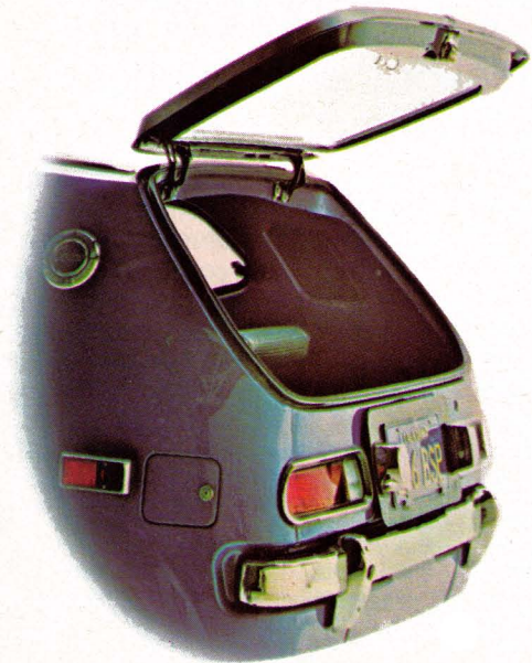
flip-up rear window, standard