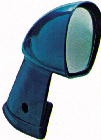
racing mirror, standard