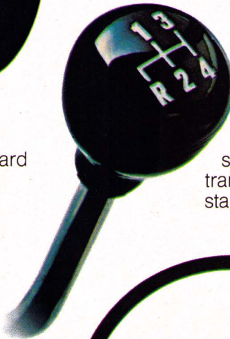
4-speed synchromesh transmission, standard