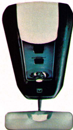
roof light console, standard