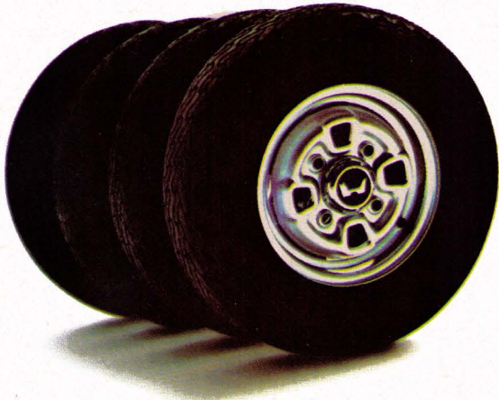
radial tires on mag-style wheels, standard