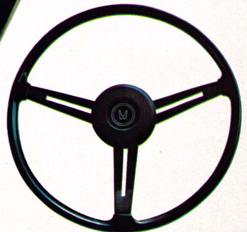
rack and pinion steering, standard